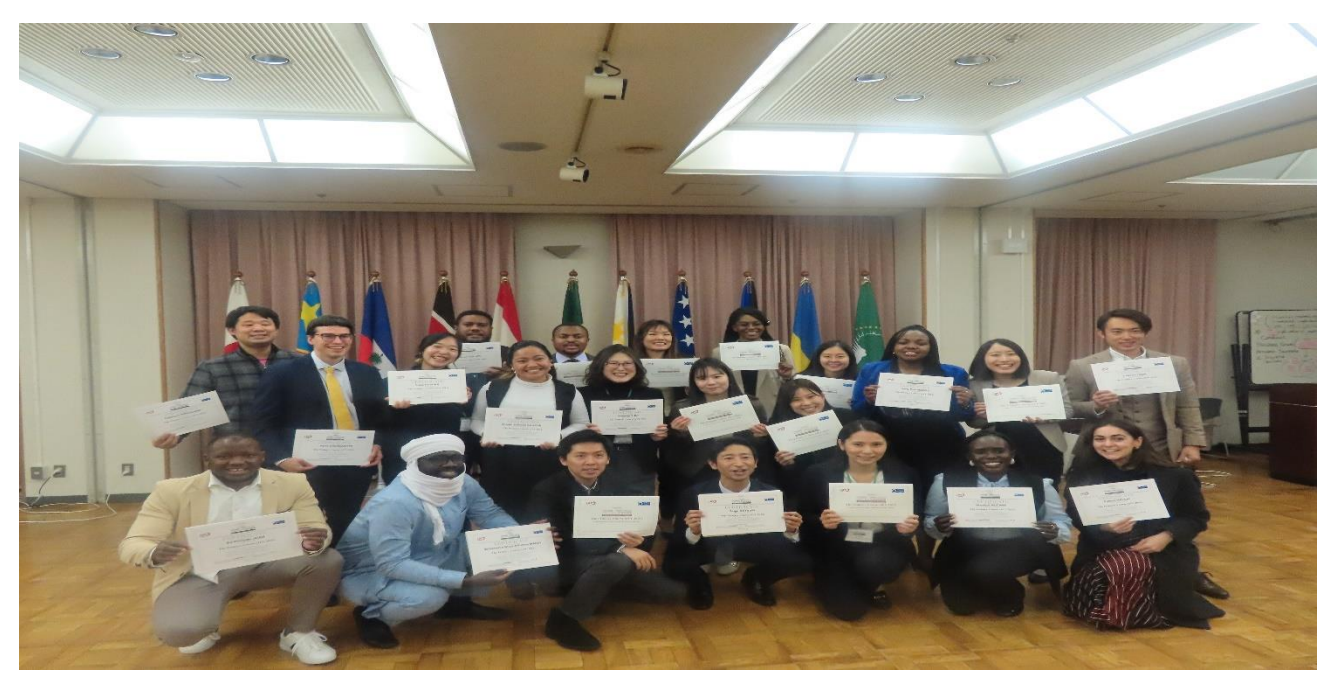
Written by APDWA Communications Team. Bukavu, 15 March 2024.